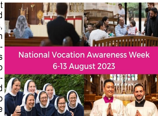
National Vocation Awareness Week 6-13 August 2023